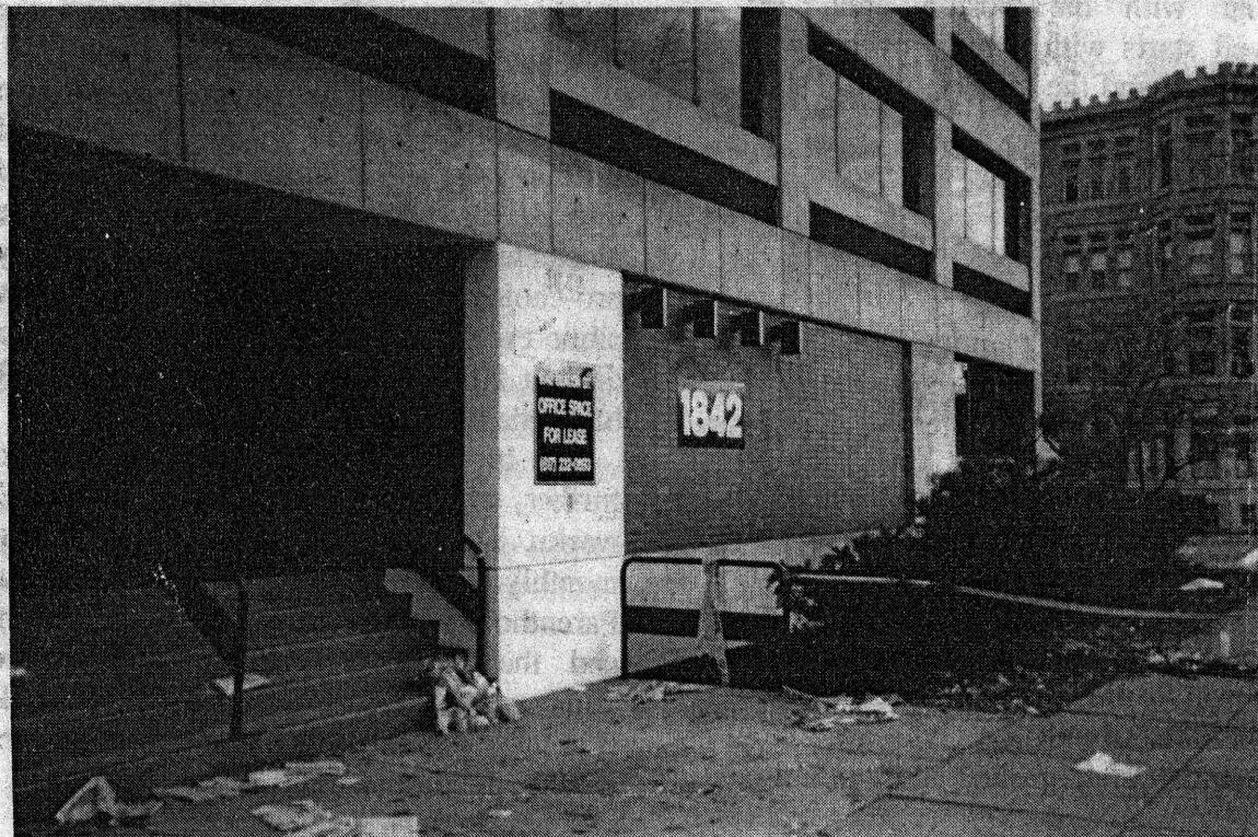
Bottom: PreTerm, the morning after. Flowers have already begun to arrive.