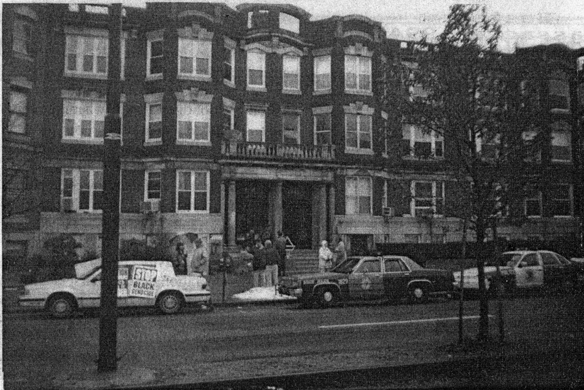
Top: the Planned Parenthood clinic (and demonstrators) a few days after the murders.