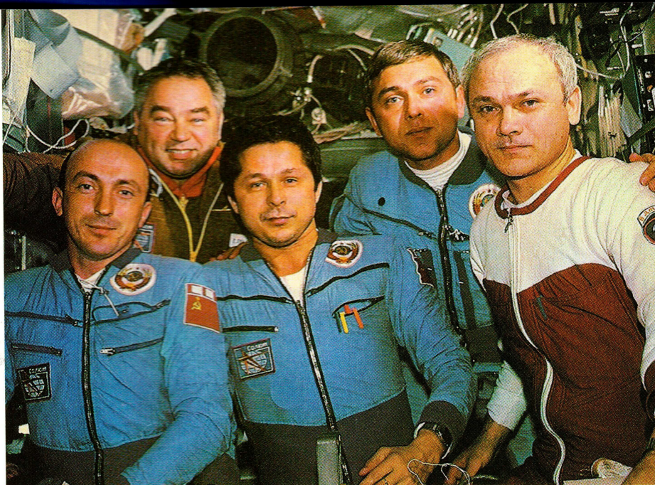
Vasyutin, Grechko, Savinykh, Volkov and Dzhaniybekov during the Soyuz T-13/T-14 handover.

month while officials tried to figure out if the crewmembers should be given the traditional post-flight awards.