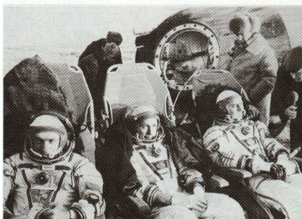
Soyuz T-14 crew shortly after landing.