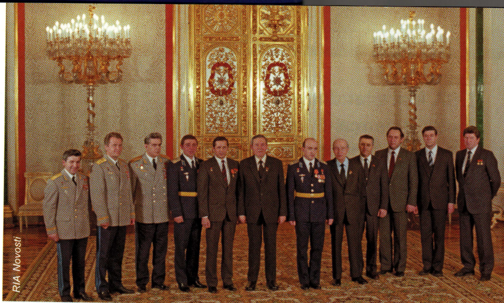
On 30 December 1985 state awards were given to Aleksandr Volkov (fourth left), Viktor Savinykh (fifth left), Vladimir Vasyutin (sixth right).

One is that Vasyutin did have some kind of medical problem before the flight (which Shatalov doesn't deny as such) but that it