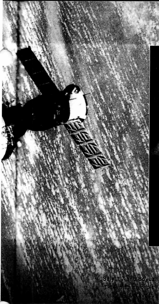
Salyut 7 and Soyuz T-14 in Earth orbit.

March, with Savinykh setting a 282 day space endurance record.