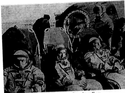
Soyuz T-14 crew shortly after landing.